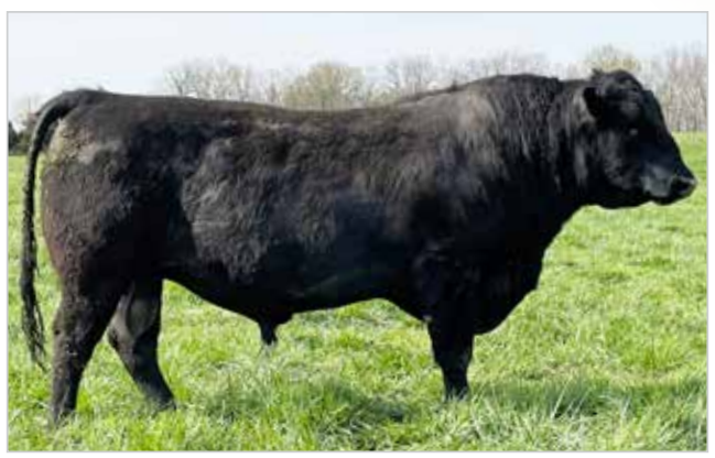
Reference Sire - BRCC Foreman 8512