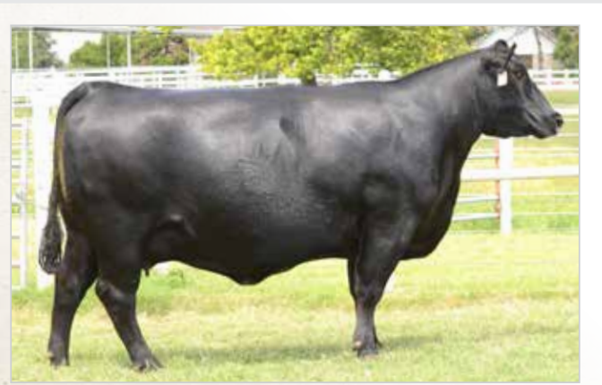
Dam of Lots 1-2, 4, 6-9, 10-13 - EXAR Miss Beauty 2819