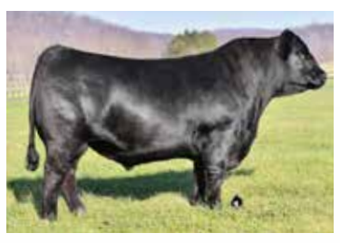
COLE GENESIS 86G Sire of Lot 58