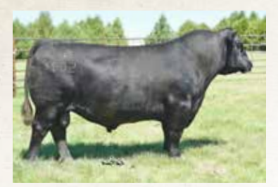
BALDRIDGE GUARDIAN Sire of Lot 51