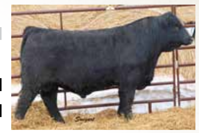
AHCC DAKOTA THUNDER 363D Sire of Lot 55