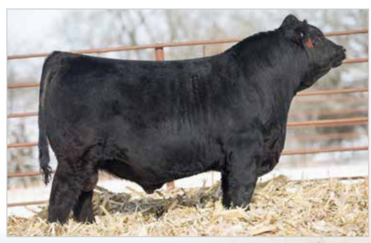
Service Sire - CELL Heavy Hitter 0011H