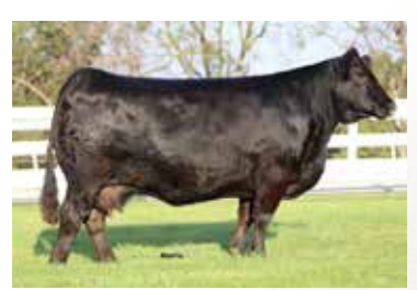
AUTO EXCEPTIONAL 282S Maternal Granddam to Lot 58