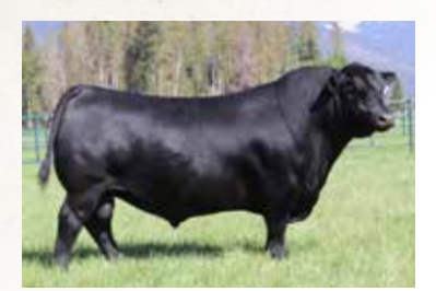
S A V DIMENSION 7092 Sire of Lot 52