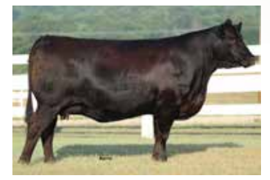
HBRL BOOTYLICIOUS 486B Dam of Lot 57