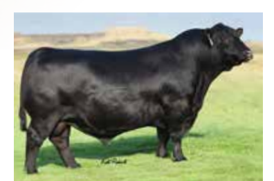
V A R POWER PLAY 7018 Sire of Lot 53

Selling as one lot EPDs available sale day