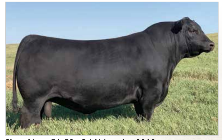
Sire of Lots 31-32 - S A V America 8018

Just like his brother, Lot 31, he is the last of our 282S sons that have been so popular at BRCC. His dam, 282S, is responsible for building the Buck Ridge Lim-Flex cowherd. It is bittersweet for us to see these last 2 sons sell. 1571 is wide-topped and stout made. His length of body is impressive and will add additional pounds at weaning. He boasts an 81 for weaning weight and a 126 for yearling weight. If you're searching for a bull that will improve growth and carcass merit look no further.