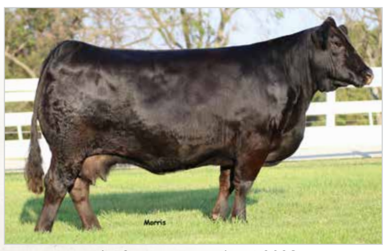
Dam of Lots 31-32 - Auto Exceptional 282S