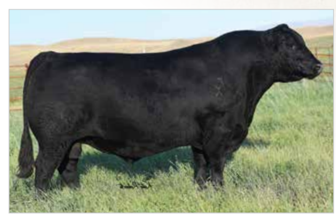
Reference Sire - EXAR Monumental 6056B