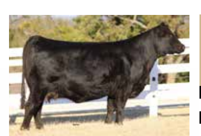
HBRL FLAMBOYANT 8521F Dam of Lot 54