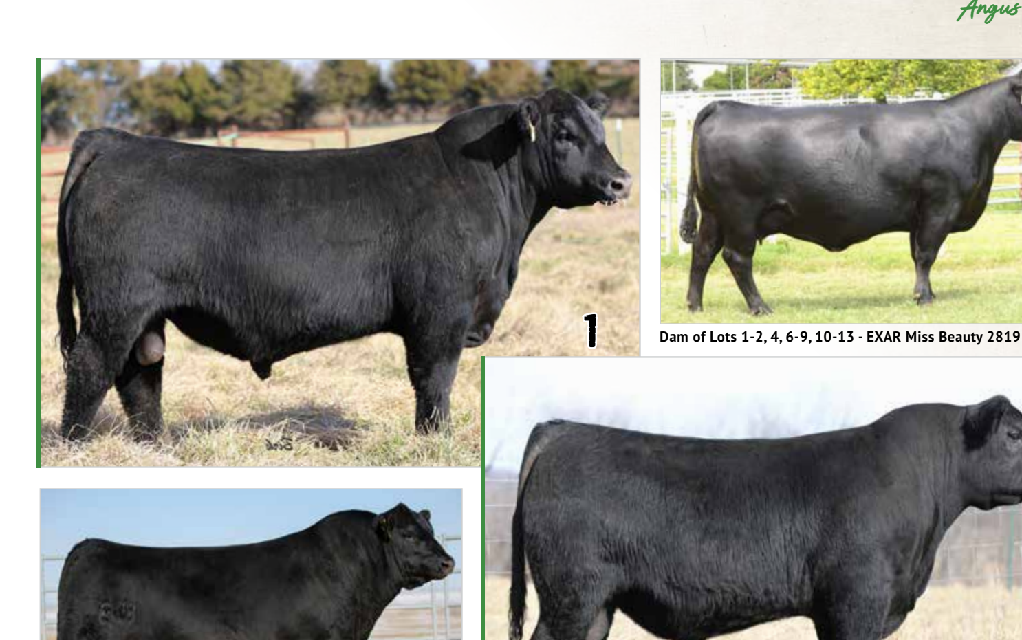
Sire of Lots 1-2 - BUBS Southern Charm AA31