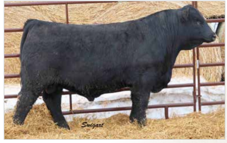
Sire of Lot 30 - AHCC Dakota Thunder 363D

BRCC Jetsetter 1520J is a special individual that rises to the top of the Lim-Flex bull offering. He has herd sire written all over him.